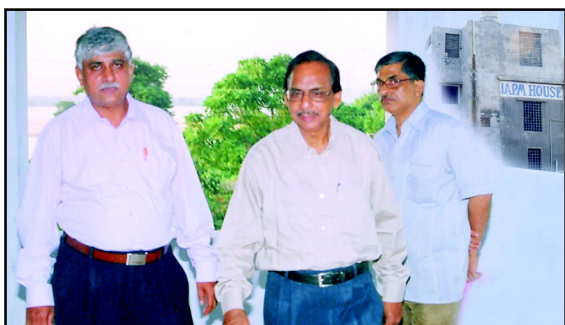
Inspecting the Head Quarter Building