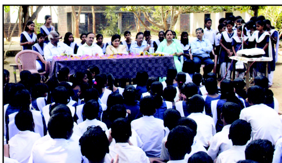
School Children in the Meeting