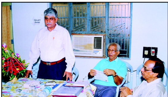
Addressing the members of HQ Advisory Committee