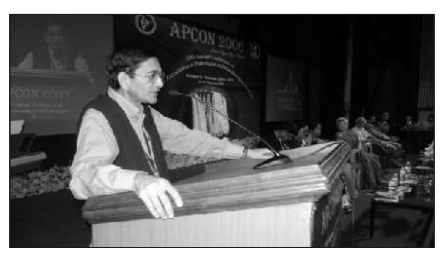
APCON - 2006

Contribution to the IAPM headquarters: Donations to the IAPM Headquarters is exempted from Income Tax under Section 80G. Several generous members and organizers of annual conferences have contributed to the IAPM Headquarters Fund. Members are requested to contribute to the fund.