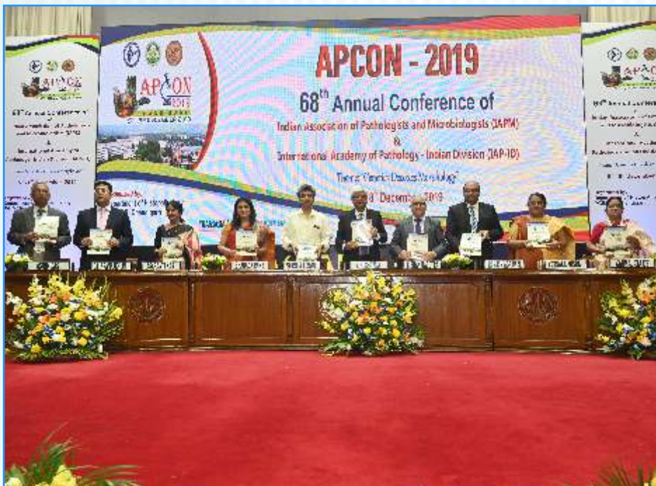
PHOTO GALLERY OF APCON 2019